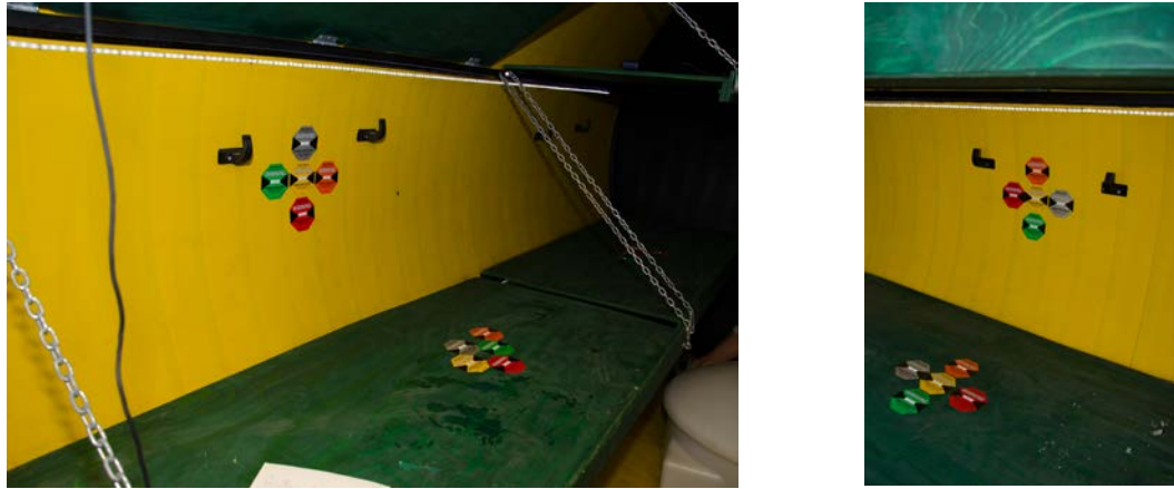
Figure 3: The layout of the ShockWatch stickers on the walls and bunks of the bunker.

course of the test, but a sticker with a higher nominal value remains intact, it can be concluded that the felt shock remains between these two values.