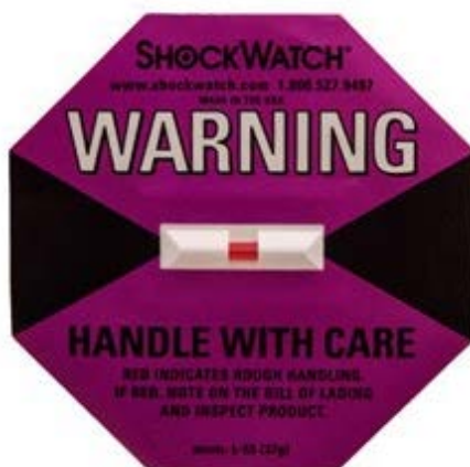
Figure 2: ShockWatch Label with a burst ampoule

A pressure wave resulting from the explosion of an explosive charge propagates through the environment as single pulses that may cause a mechanical shift when transferring from the ground into the bunker, which can be felt as single shocks or blows. If the shock or blow is strong enough, it may cause damage to the health. To carry out this evaluation, the "ShockWatch Label" shock-sensitive stickers from the ShockWatch Corporation were used. The sensitivity of these devices to acceleration and its duration is similar to that of the human body.